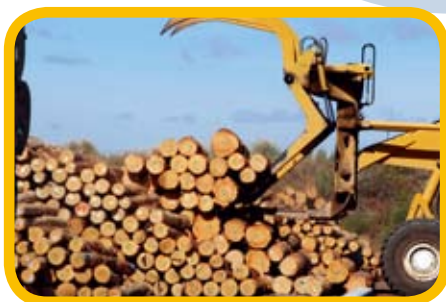
It's a busy time at Eastland Port with record cart-in volumes of logs being recorded.

Gisborne's status as one of the nation's leading log export ports continue to rise with the latest figures just out ranking us number two log exporter in New Zealand.