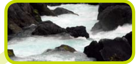
Steady as she goes....a constant supply of water is key to successful small hydro electricity generation.

There are plenty of pluses to this project – costs are lower, it alleviates the need to upgrade capacity of transmission lines from Tuai and is far more environmentally friendly for all.