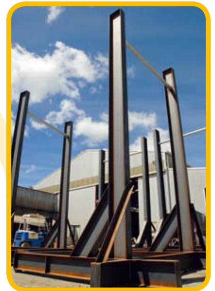
In production... the new taller bookends, being made by Gisborne Engineering, are almost ready for placement.

The bookends increase log storage efficiency between 10-15%, allowing an extra 70,000-80,000 tonnes of logs a year to be stored at the port.