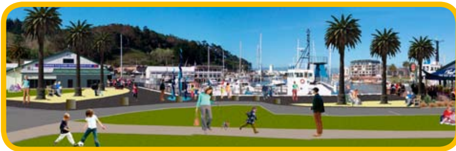
OPTION 1 - ESPLANADE GATEWAY TREATMENT

Palm tree planting frames the view through to the Port at the Esplanade gateway, creating a bold entrance to the Port site. Landscape features include palm tree planting, feature paving areas with seating, grass areas for relaxing, a sculptural installation, and coloured mood lighting set into the ground for night time effect.